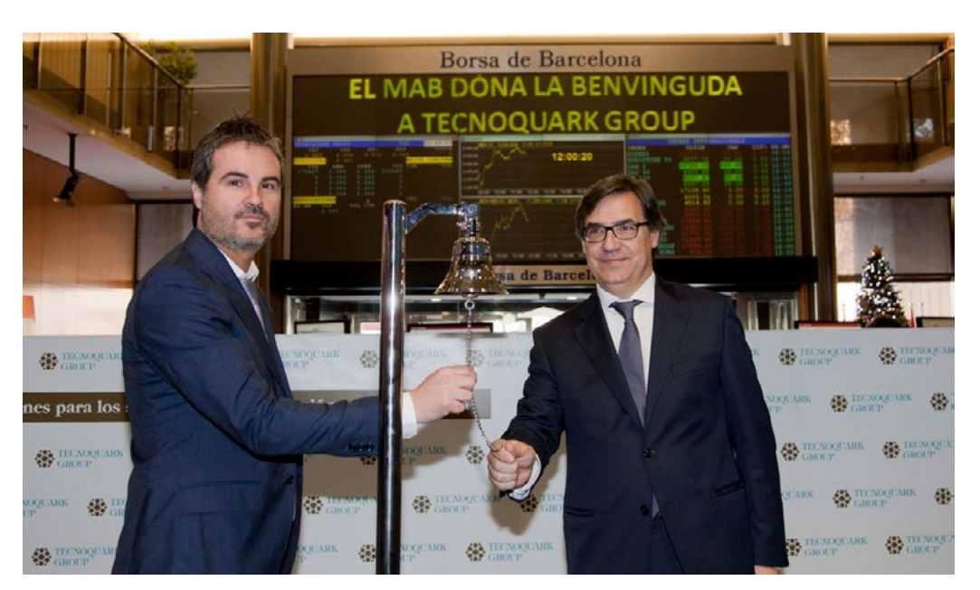
Tecnoquark representatives commemorated their new listing on MAB

Both the Regulations of the Board of Directors and of the Markets and Systems Operating Procedures Committee and the activity reports of the Board's Committees from each financial year can be found in the "Information for Shareholders and Investors" section of the corporate website www.bolsasymercados.es.